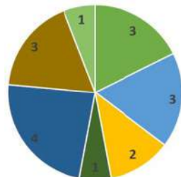
NUMBER OF LATE PUPILS