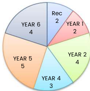
NUMBER OF LATE PUPILS